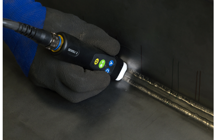
Amigo™ 2 ACFM Instrument for Tank Car External Weld Inspection, ACFM SENSU2 Pencil Probe for Faster Inspections